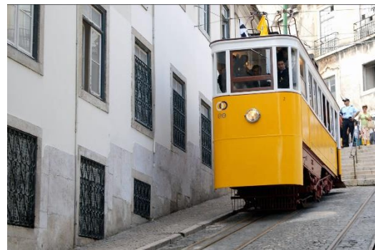
Fig. 2 – Recent photograph of the Glória funicular.

In 2002 it was classified as a National Monument and remains in operation to this day, linking Restauradores and São Pedro de Alcântara .