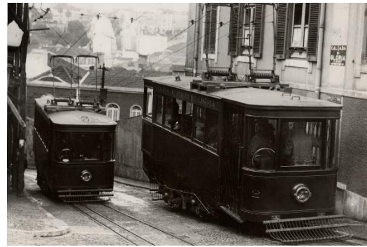
Fig. 1 – 1930 photograph of the Glória funicular.

Initially, its traction system was a rack and cable by water counterweight. This system was replaced by a steam engine before its electrification in 1915.